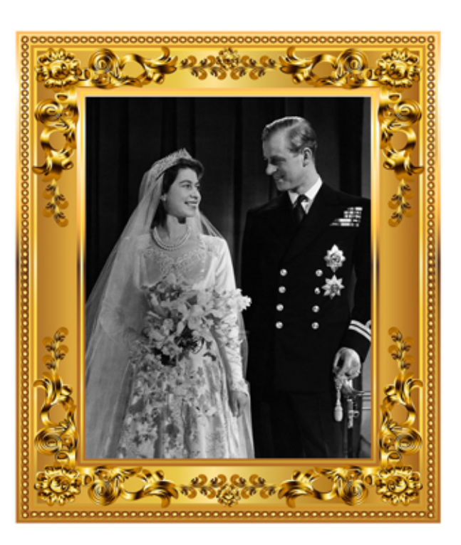
1947 PRINCESS ELIZABETH MARRIED PRINCE PHILIP