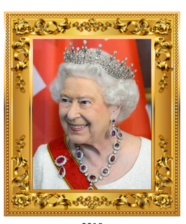
2015 THE QUEEN BECAME THE LONGEST REIGNING BRITISH MONARCH, OVERTAKING QUEEN VICTORIA