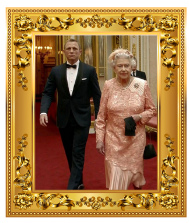
2012 THE QUEEN STARRED ALONGSIDE JAMES BOND AT THE OPENING OF THE 2012 OLYMPIC GAMES