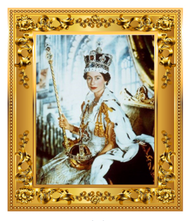
1953 QUEEN ELIZABETH II WAS CORONATED IN WESTMINSTER ABBEY