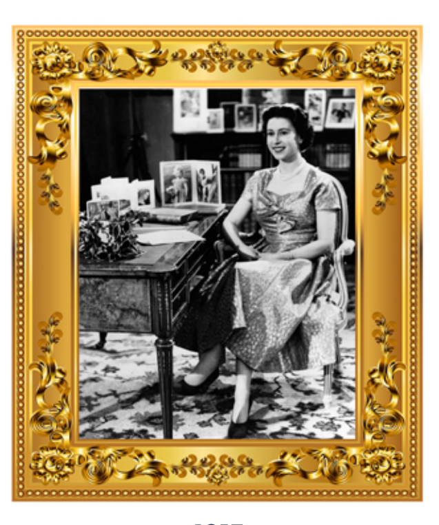
1957 QUEEN ELIZABETH II DELIVERED THE FIRST TV CHRISTMAS BROADCAST