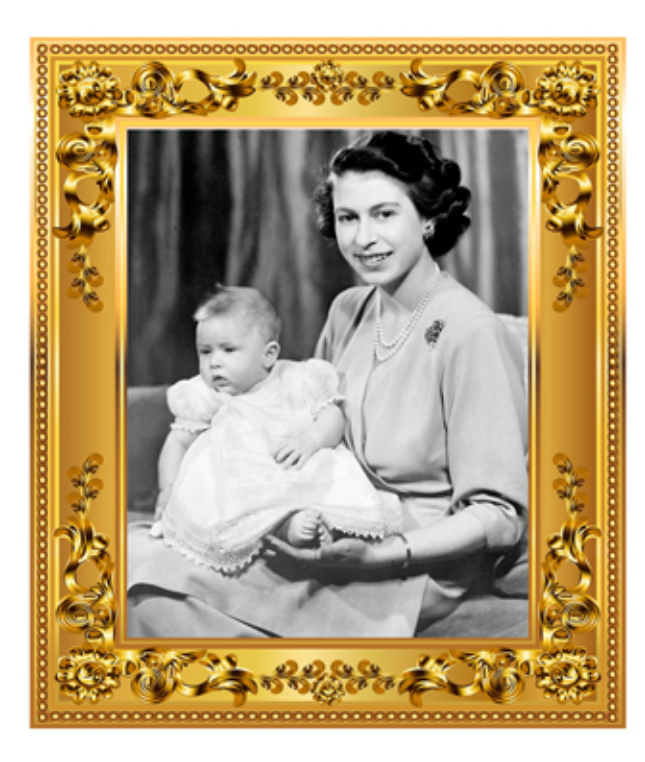
1948 PRINCESS ELIZABETH GAVE BIRTH TO PRINCE CHARLES