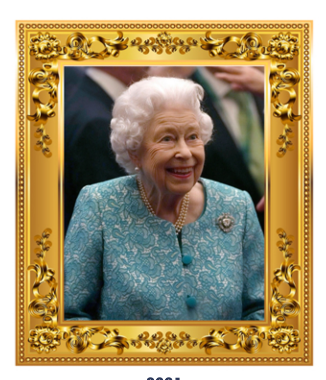
2021 QUEEN ELIZABETH II CELEBRATED HER 95<sup>TH</sup> BIRTHDAY