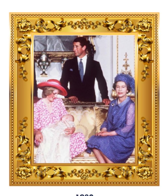
1982 PRINCE WILLIAM WAS BORN, BECOMING SECOND IN LINE TO BE KING AFTER HIS FATHER, CHARLES