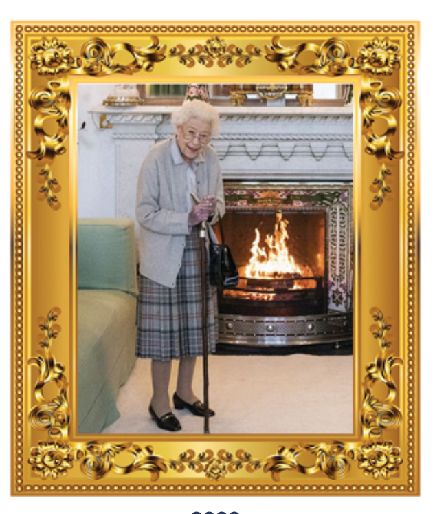
2022 THE QUEEN DIED AT BALMORAL, AFTER 70 YEARS ON THE THRONE