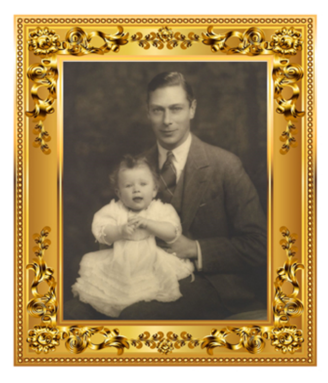
1926 PRINCESS ELIZABETH WAS BORN IN LONDON