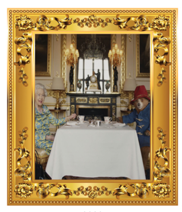
2022 THE QUEEN HAD TEA WITH PADDINGTON BEAR AT HER PLATINUM JUBILEE