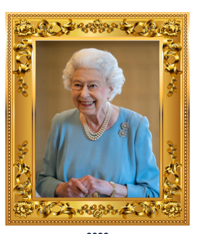
2022 QUEEN ELIZABETH II CELEBRATED HER PLATINUM JUBILEE (70 YEARS)