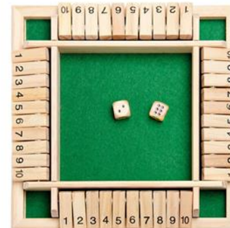
SHUT THE BOX