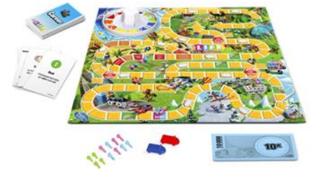
THE GAME OF LIFE