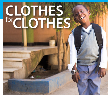
Turning your OLD CLOTHES into NEW SCHOOL UNIFORMS