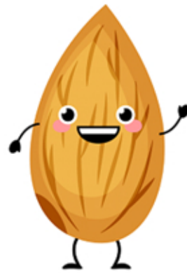
Winding People Up